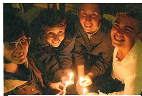
Lighting Candles of Hope

A crucial contribution to our campus faith community is made by volunteers from United Churches, who support the ministry through preparing weekly soup dinners and joining in the fellowship following instructional or communion sessions. Few young adults explore their faith identity and development in traditional Sunday morning services any more. But our United Church Campus Ministry faith activities are active and growing . Student participants welcome elders from our churches to join them in our campus community of faith, to share and explore the relevance of faith in a troubled time.