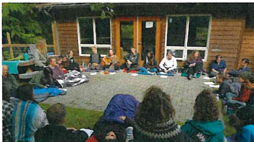
Meditation Retreat October 2019

action. The Campus Ministry hosted Ego to Eco , an evening of student art, music and spoken word on the theme of Indigenous wisdom and relationship with Creation. It supported student leadership for the Friday Climate Strike at the BC Legislature. Spurred again by our student leaders, the Campus Ministry hosted an 8-hour 'Meditation Marathon' fundraiser for RAVEN, the Indigenous legal defense organization. We are enthusiastic to support reconciliation through collaborative activities with Indigenous groups on campus.